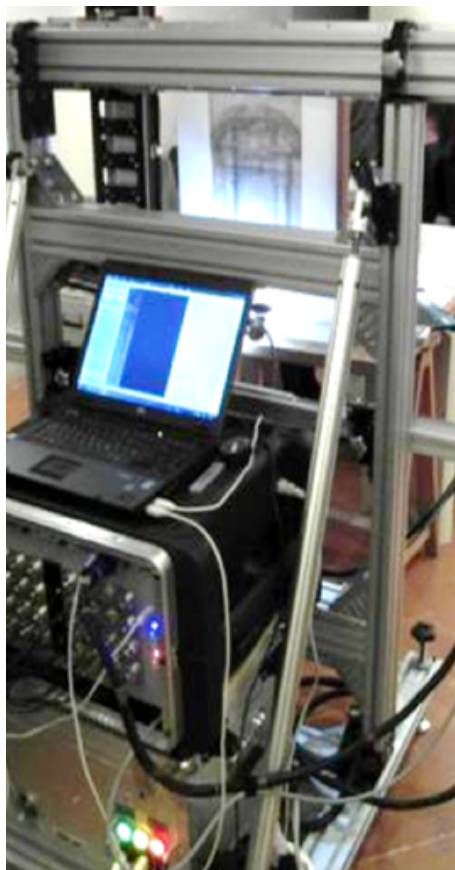
Vis NIR scanner

MOLAB 1: CNR, Consiglio Nazionale delle Ricerche CNR-ISTM, CNR-INO with linked third parties UNIPG, Perugia-Firenze, IT.