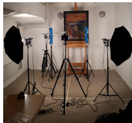
Reflectance and Fluorescence Hyperspectral Imaging